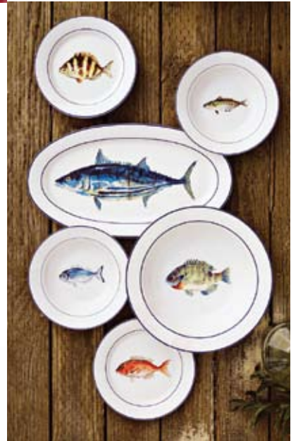
CLOCKWISE FROM ABOVE LEFT: CHOCOLATE MOUSSE; LA MER PLATES, WILLIAMS-SONOMA; LAURENT-PERRIER ROSÉ CHAMPAGNE; COCONUT CUPS, COCONUT KING; CORAL PLATES, Z GALLERIE.