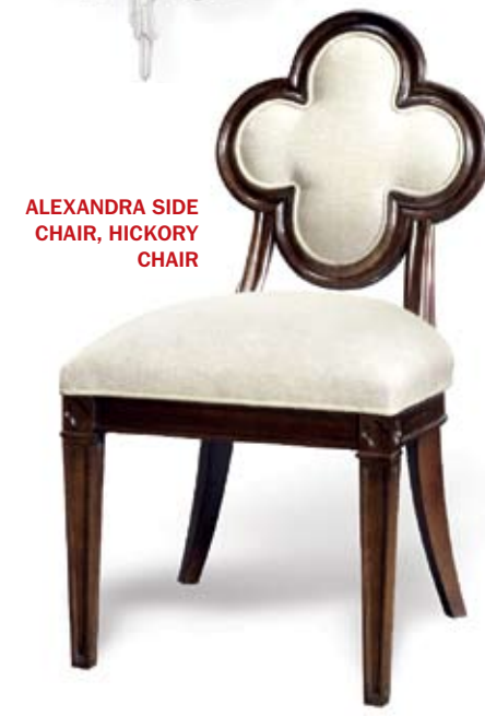
ALEXANDRA SIDE CHAIR, HICKORY CHAIR