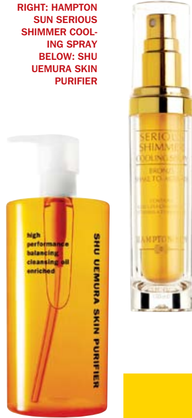
RIGHT: HAMPTON SUN SERIOUS SHIMMER COOLING SPRAY BELOW: SHU UEMURA SKIN PURIFIER