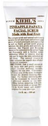
LEFT TO RIGHT: YVES SAINT LAURENT TOUCHE ÉCLAT; KIEHL'S PINEAPPLE PAPAYA FACIAL SCRUB; GIORGIO ARMANI SHEER BLUSH #10; GARNIER NUTRI-PURE CLEANSING TOWELETTES.